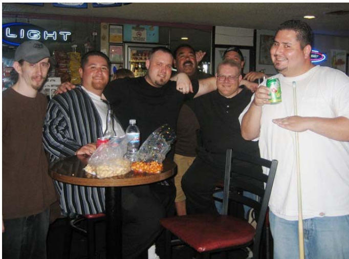
The boys from Tommy's Guns